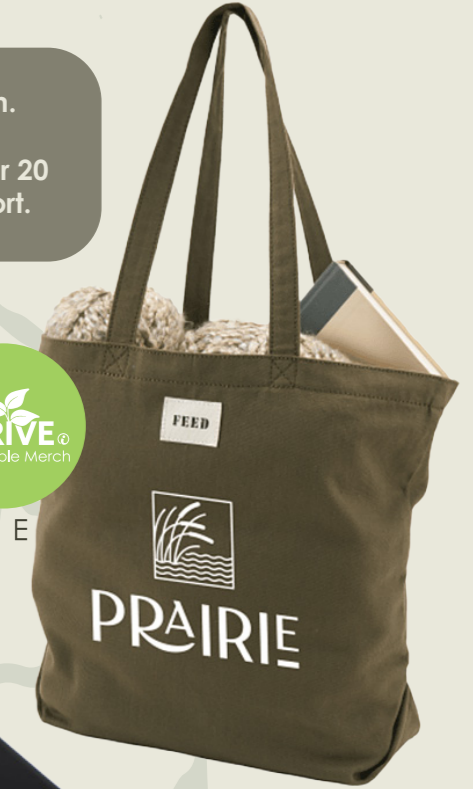
A: RPET Felt & Bamboo Pencil Kit with Phone Stand, B: Bamboo Click Pen, C: Stormtech Pure Earth Oasis Polo, D: Wireless Microphone Set, E: FEED Organic Cotton Shopper Tote