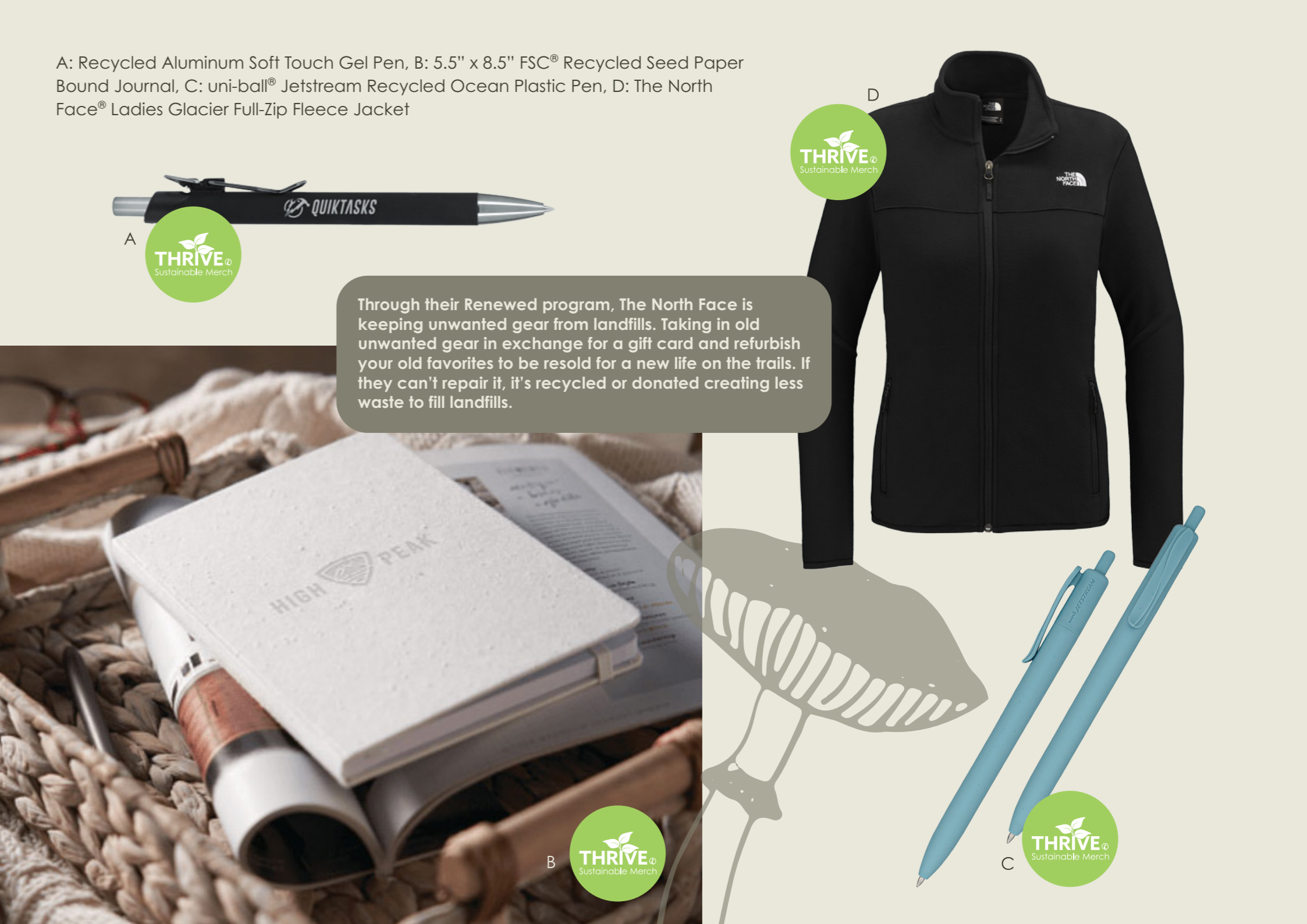
A: Recycled Aluminum Soft Touch Gel Pen, B: 5.5" x 8.5" FSC® Recycled Seed Paper Bound Journal, C: uni-ball® Jetstream Recycled Ocean Plastic Pen, D: The North Face® Ladies Glacier Full-Zip Fleece Jacket