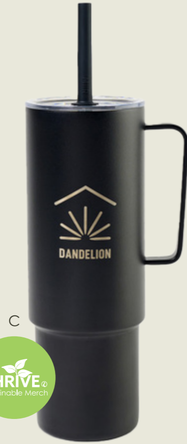
A: Nike Dri-FIT Recycled Quarter Zip, B: Anker® Soundcore Life Q20i Wireless Noise Cancelling Headphone, C: Miir® 32oz All Day Camp Cup, D: Out of the Woods Supernatural Paper Mini Market Tote